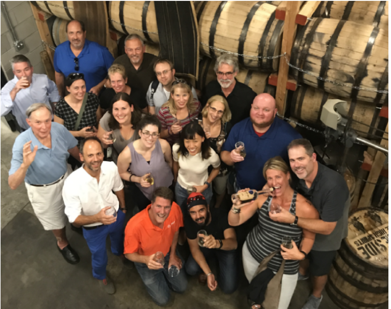
Ace Eat Serve