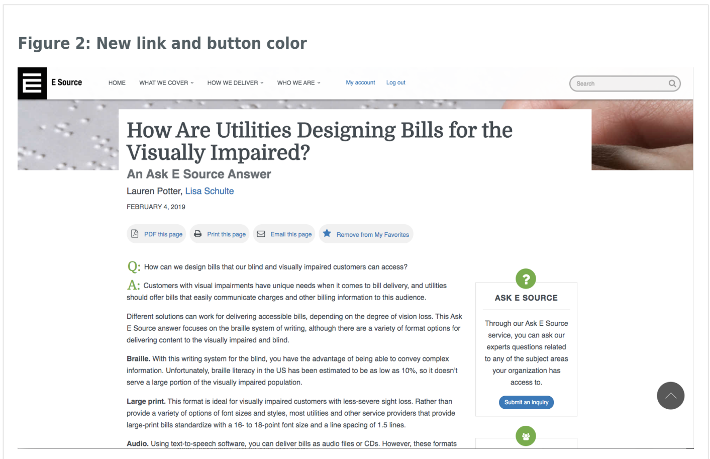
Figure 2: New link and button color

Our design team solved this issue by using our other favorite E Source color, blue, which gives a healthy ratio of 4.5:1.0 ( figure 2 ).